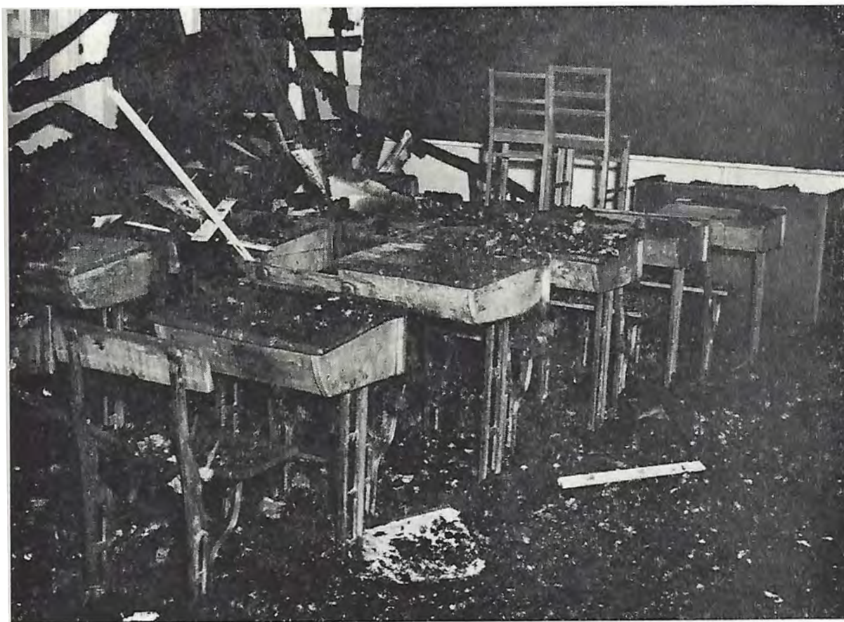
THE FIRE THAT GUTTED THE EAST WING