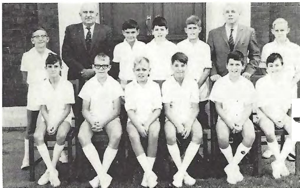
1st XI CRICKET, 1970