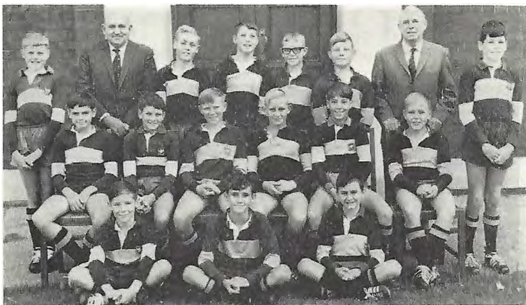
1st XV RUGBY, 1970