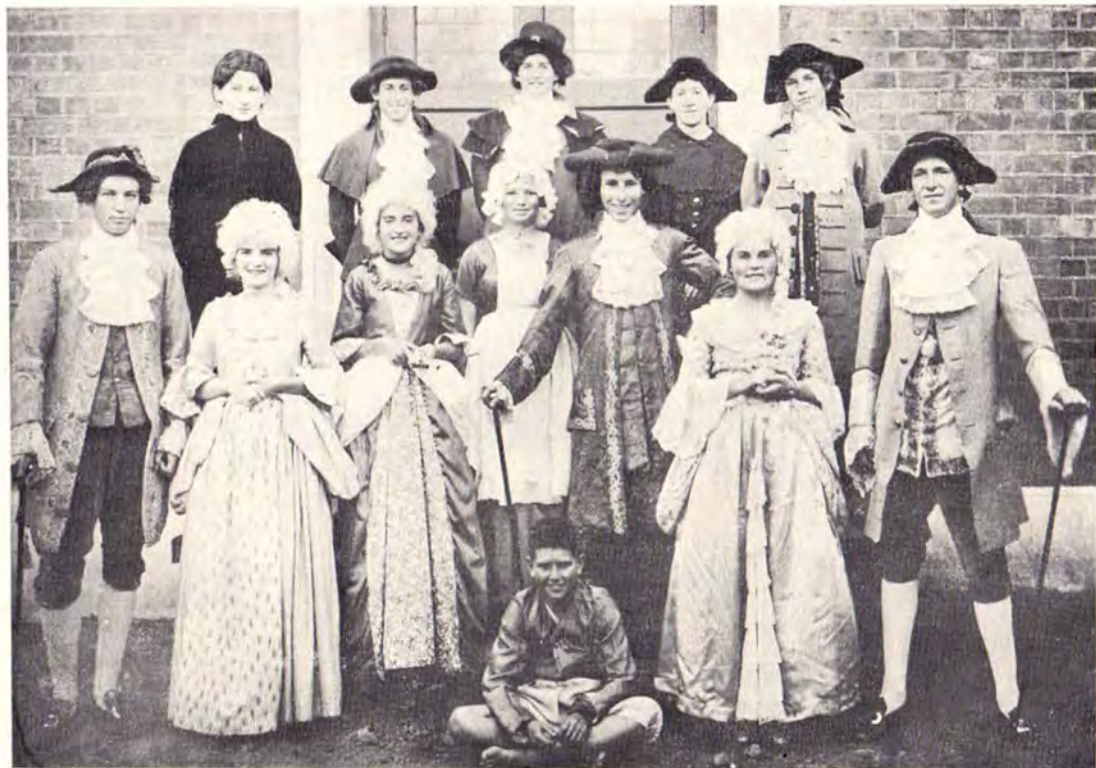
THE CAST OF "THE RIVALS," PRODUCED IN THE ALLAN WELSH HALL ON 6th APRIL, 1935